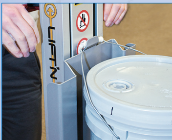
Pail retainer keeps loads secure.