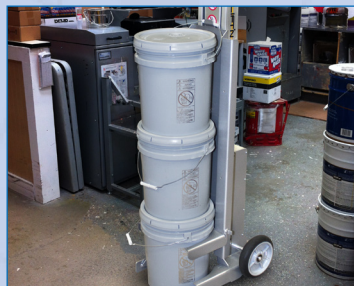
200 lb. lifting capacity safely handles 3 pails at a time.