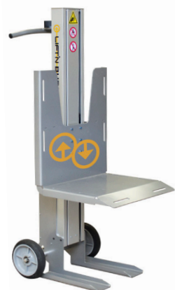
Lift'n Buddy LNB-2