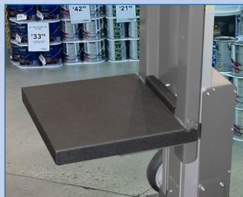
Optional platform for loose cans or other case packed goods.