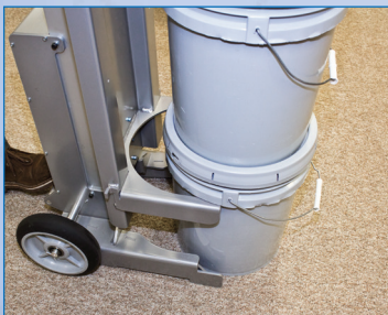
Lifting yoke holds pails in place.