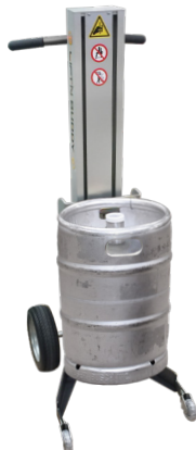
Lift'n Buddy Keg Lifter