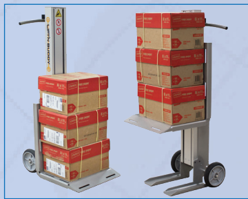
Base legs allow the LNB-2 stand even when loaded and raised.