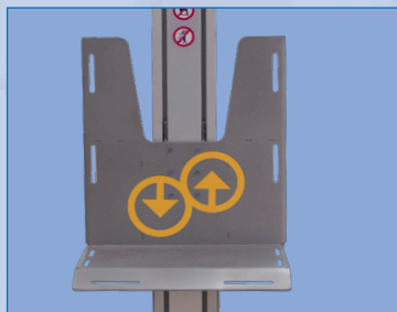
Platform slots for securing loads with bungees or straps.