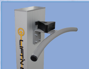
Ergonomic handle with lifting and lowering thumb switch.