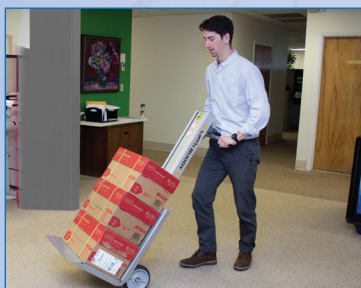
As simple to use as any 2-wheel hand truck.