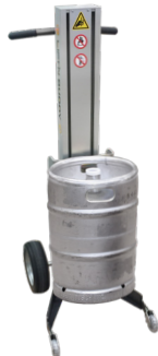
Lift'n Buddy Keg Lifter