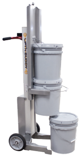
Lift'n Buddy Pail Lifter