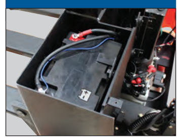
Sealed, maintenance-free AGM batteries and heavy-duty built in charger with fuse protection.