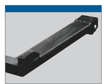
Solid steel straddle legs provide rigidity and eliminate deflection even under maximum load conditions.