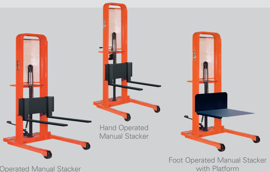
Foot Operated Manual Stacker

Presto Manual Stackers incorporate a number of ergonomic and safety features in rugged, user-friendly designs with capacities up to 2,000 lbs. Choose from foot-pump operated, hand-pump operated, or hand-crank operated lift mechanisms.