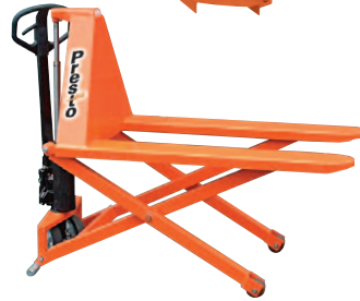
Manual Skid Lifter