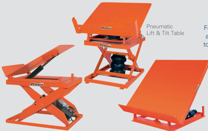
Pneumatic Lift & Tilt Table

For individual control of lift height and tilt angle, Presto Lift & Tilt Tables allow you to position work at the most comfortable height and angle. Fixed Height Tilters are also available and can be mounted on legs, work benches, or directly to the floor.