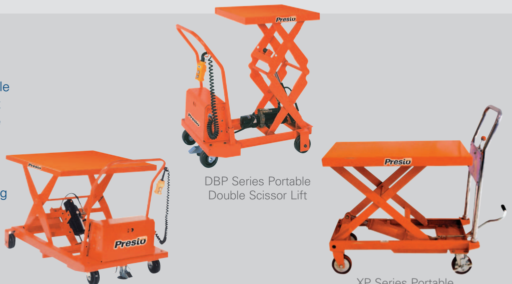
XBP Series Portable Electric Scissor Lift

Presto Portable Lifts are available in both powered and manual lift configurations. Capacities range from 300 to 1,500 lbs. with vertical travel up to 36". They are ideal for repositioning loads within a work cell or transporting them from one area to another.