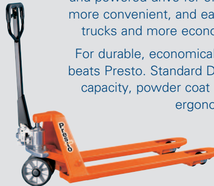
Standard Duty Presto Pallet Truck