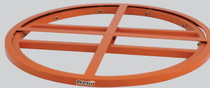
Floor Mount Turntable Ring

Turntables can be used in palletizing, assembly, or work positioning applications. The Presto Low Profile Turntable and Floor Mount Turntable Ring are portable and can be moved easily from one work area to another. Standard turntables can be mounted to the floor, to a fixed height stand, or to a lift table.