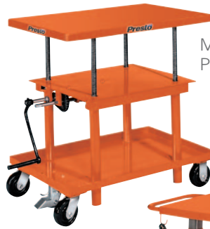
Mechanical Post Lift

Available in mechanical crank, four-post style, electric hydraulic and manual hydraulic post style, and manual hydraulic cantilever style. Choose from 1,000, 2,000, or 4,000 lb. capacity units.