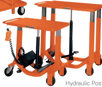
Hydraulic Post Lift