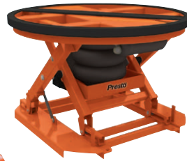
P3™ All-Around Pneumatic Load Leveler