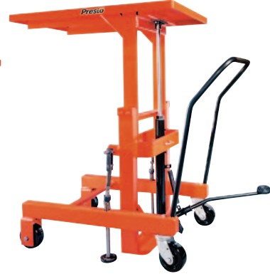
Hydraulic Cantilever Lift