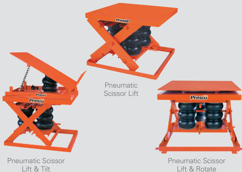
Pneumatic Scissor Lift