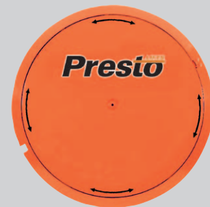
Low Profile Turntable