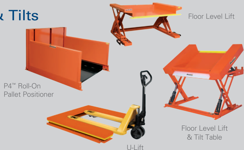
Floor Level Lift

Presto's wide variety of floor level equipment can be fed with ordinary hand pallet trucks eliminating the need for fork lift trucks and trained operators. Lift only and Lift & Tilt models are available.