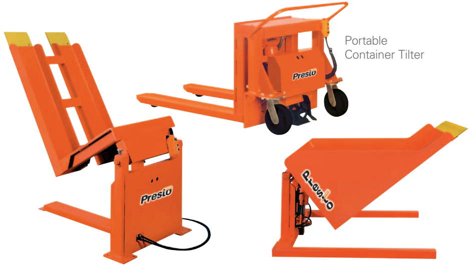
Stationary Container Tilter

Position containers and wire baskets at a comfortable height for accessing contents. Available in 2,000 and 4,000 lb. capacities with 89° of tilt. Stationary units can be fed with hand pallet trucks. DC powered portable units are ideal for sharing between work cells or retrieving staged containers. Floor Level units work with any style of container and can also be fed by a hand pallet truck.