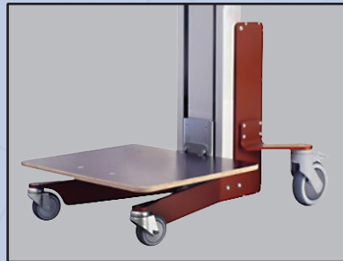
Laminated Wood Platform