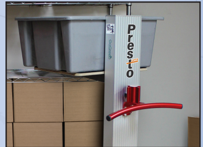
Position loads at shelf height for easy loading and unloading