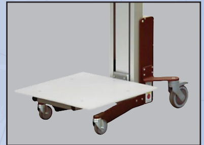
HDPE Plastic Platform