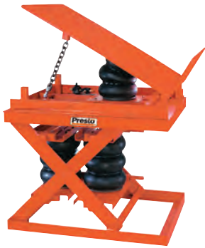
Pneumatic Scissor Lift & Tilt