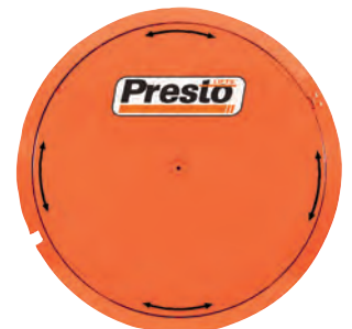
Low Profile Turntable