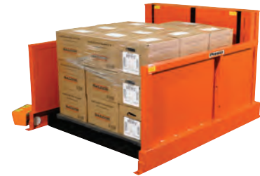
P4™ Roll-On Pallet Positioner