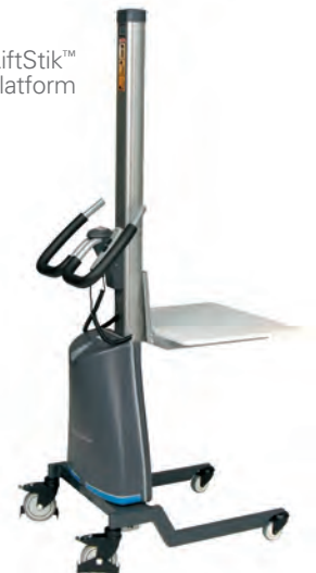
LiftStik™ With Platform