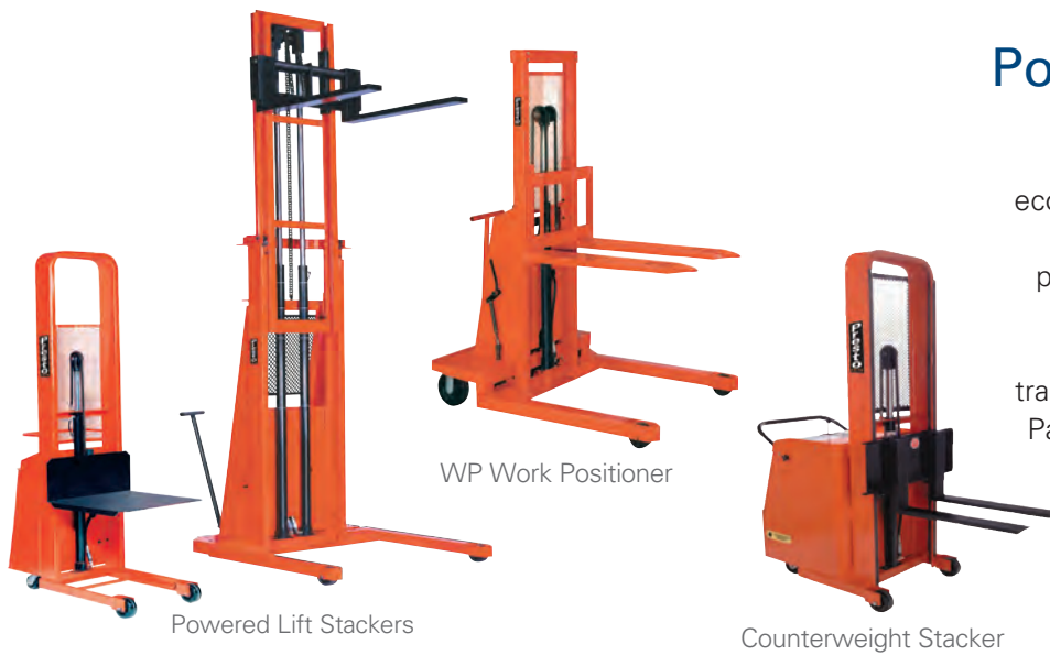
Powered Lift Stackers

For light to medium-duty usage, Powered Lift Stackers offer an economical alternative to forklift trucks. Units can be equipped with forks or platforms and are available in straddle or counterweight designs. The WP Work Positioner is ideal for lifting, transporting and assembly applications. Pallet Stackers can service racks up to 12' high with loads up to 3,000 lbs.