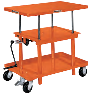
Mechanical Post Lift

Post lift tables are available in a variety of configurations including two-post, four-post, and cantilever. Choose 1,000, 2,000, or 3,000 lb. capacity units with platform sizes from 20" x 30" up to 30" x 60". Lifting and lowering options include mechanical hand crank, foot pump actuated and electrohydraulic.