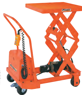
DBP Series Portable Double Scissor Lift