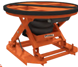
P3™ All-Around Pneumatic Load Leveler