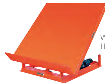
Wide Base Fixed Height Tilter