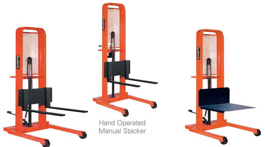
Foot Operated Manual Stacker

Manual Stackers incorporate a number of ergonomic and safety features in rugged, user-friendly designs with capacities up to 2,000 lbs. Choose from foot-pump operated, hand-pump operated, or hand-crank operated lift mechanisms. Units can be equipped with either forks or platforms.