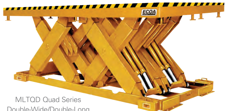
MLTQD Quad Series Double-Wide/Double-Long