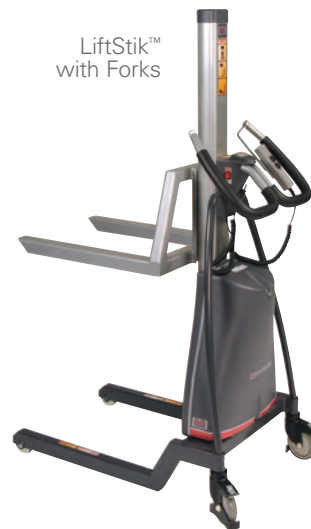
LiftStik™ with Forks