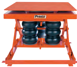
Pneumatic Scissor Lift & Rotate