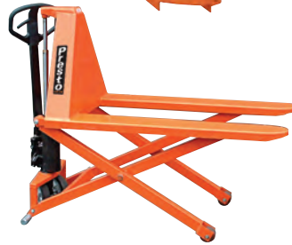
Manual Skid Lifter