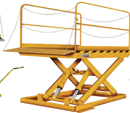
SizzrDok HLD Series Dock Lifts