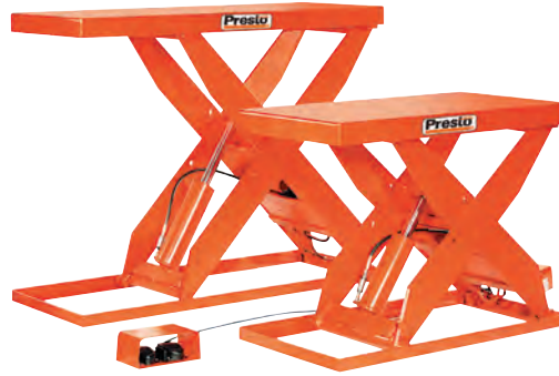
XL Series Standard Duty Scissor Lifts

Presto ECOA Lifts offers a full line of Hydraulic Scissor Lift Tables with capacities up to 12,000 lbs., available in: Light Duty; Standard Duty; Heavy Duty; and Compact, Double High configurations. They position material at just the right level to eliminate bending, stretching, and reaching.