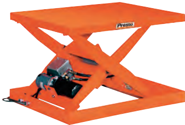
XS Series Light Duty Scissor Lifts