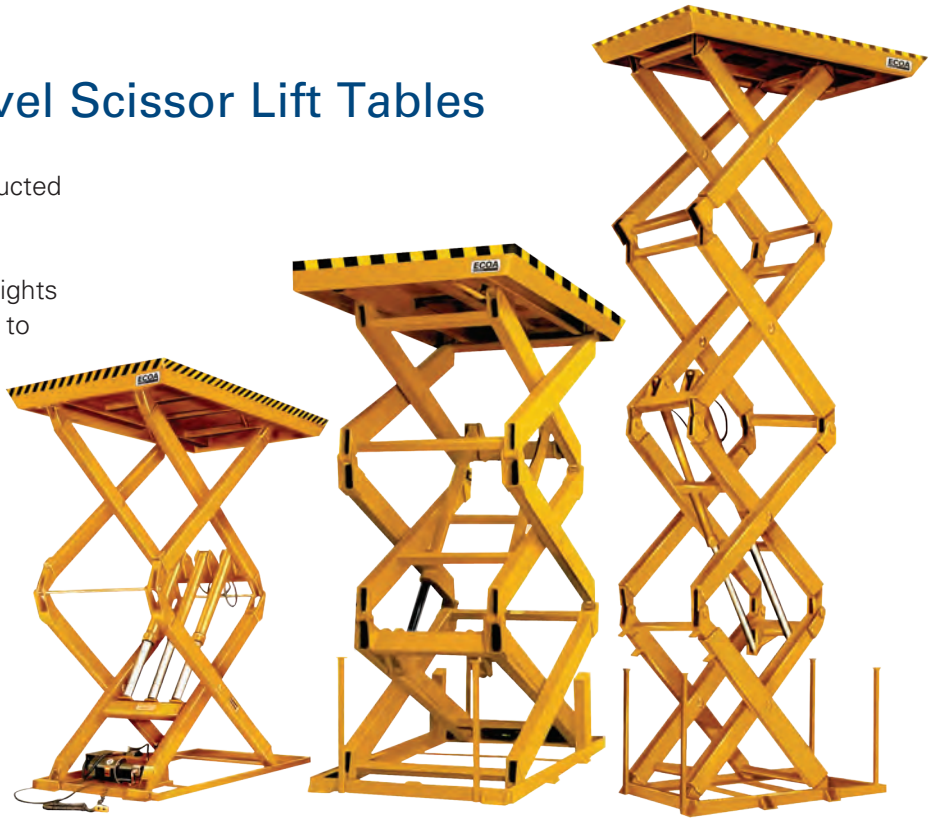
DSL Series Double Scissor Lift Tables

These high-travel double, triple, and quad scissor lift tables are designed and constructed for heavy-duty applications that require extended vertical travel. Multiple scissor mechanisms allow for maximum lifting heights in a small footprint. Capacities from 2,000 to 6,000 lbs. are available with lift heights from 70" up to 356".