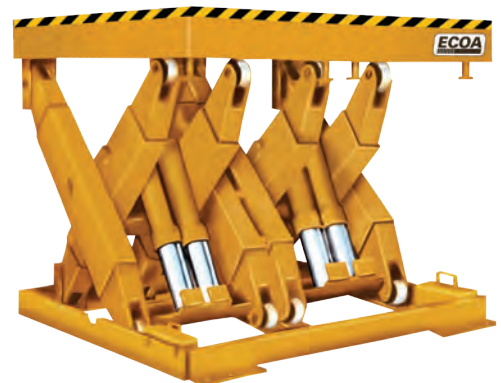
MLTDL Double-Long Series