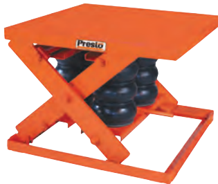
Pneumatic Scissor Lift