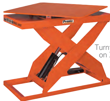
Turntable Mounted on XL Series Lift

Standard turntables can be mounted to the floor, to a fixed height stand, or to a lift table.