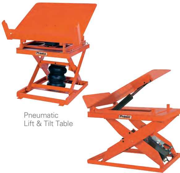
Pneumatic Lift & Tilt Table