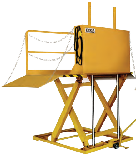
Trans-A-Dock TAD Series Surface Mount Loading Dock Lifts