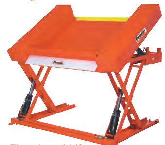
Floor Level Lift & Tilt Table