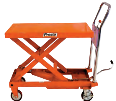
XP Series Portable Manual Scissor Lift