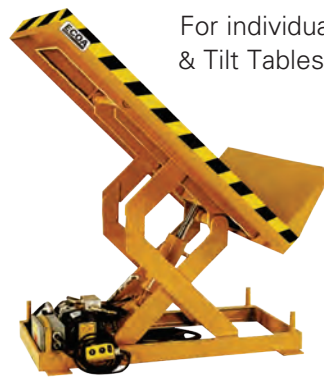
CLTLT Series SpaceSaver Lift & Tilt Tables

Fixed Height Tilters are also available and can be mounted on legs, work benches, or directly to the floor.