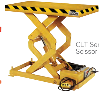
CLT Series Double Scissor Lifts