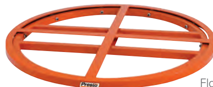
Floor Mount Turntable Ring