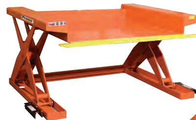
Floor Level Lift