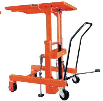
Hydraulic Cantilever Lift