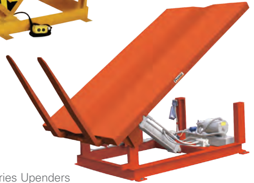
UT90 Series Upenders