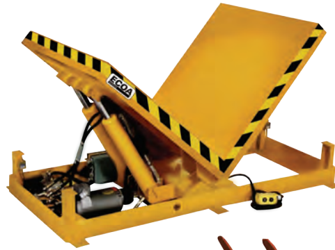
HUE Series Upenders

UT90 Series Upenders are available with platens or forks as well as optional v-cradle platforms.