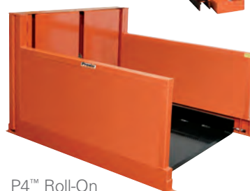
P4™ Roll-On Pallet Positioner