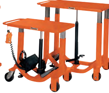
Hydraulic Post Lift