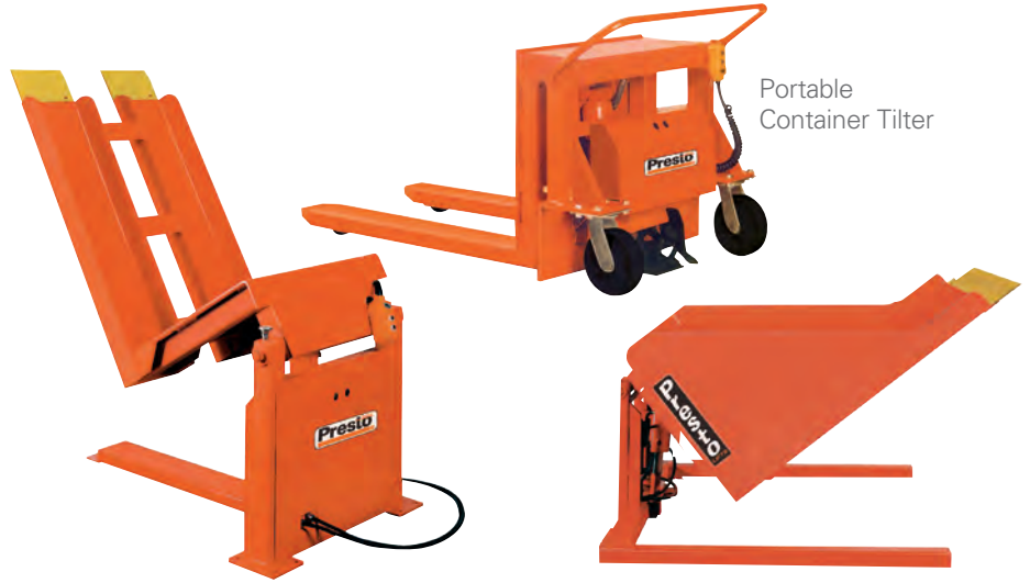
Stationary Container Tilter

Floor Level units work with any style of container and can also be fed by a hand pallet truck.