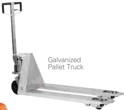
Galvanized Pallet Truck